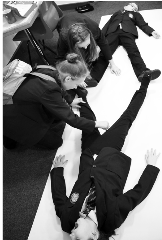
Fig. 1 “Mappa Mundi” workshop at Benfield School (author’s photograph. Consent received from the school and the participants for use of the photograph in relation to this project.)

Our improvisatory and reactive approach to the research enabled us to learn from, and respond to, adaptations and innovations by the participants themselves and to incorporate these in subsequent workshops. One exercise, for example, was developed by three sixth