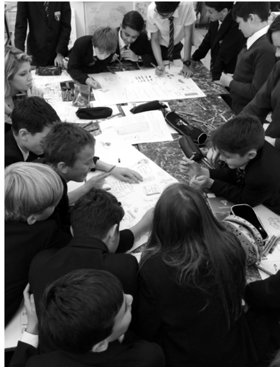
Fig. 2 “Personal Geographies” workshop at Newcastle Royal Grammar School (author’s photograph. Consent received from the school and the participants for use of the photograph in relation to this project.)

On a blank sheet of A3 cartridge paper, we asked participants to draw “My World”. For many this was interpreted as their journey to school and to regular sport, leisure and social activities, as well as friends’ and family members’ houses. In the pilot project, the journeys were drawn on acetate, rather than paper, over an orthographic map. The mappings made on cartridge paper, without tracing, tend to have a richer iconography. Journeys to school reveal labyrinthine connections of friends, extended families, gathering places (like convenience stores) and streets which are instinctively avoided. We also asked some participants to draw their schools. Drawings of schools documented oral history and folk law, spatial ownership and spatial grievances.