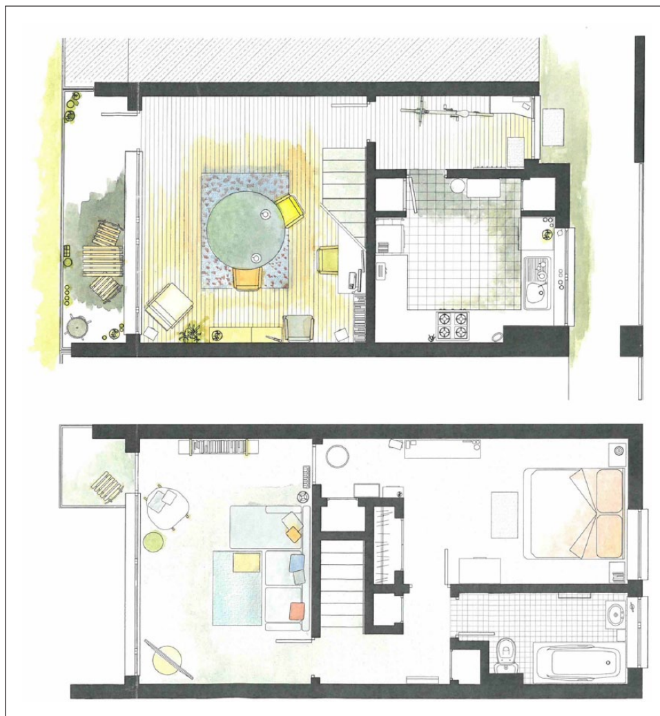
Figure 2. Contextual mapping, showing spatial practice and atmosphere of place in Nicola and David's flat.

findings and to see how living patterns and spatial appropriation take place at home.