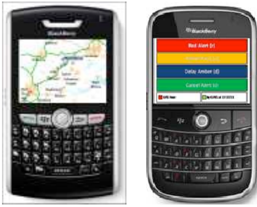
Figure 3. A BlackBerry 8800 displaying a typical location map (left), and an example of the Alert Client: ‘Red Alert, Amber Alert, Delay Amber, Cancel Alert’ (right).